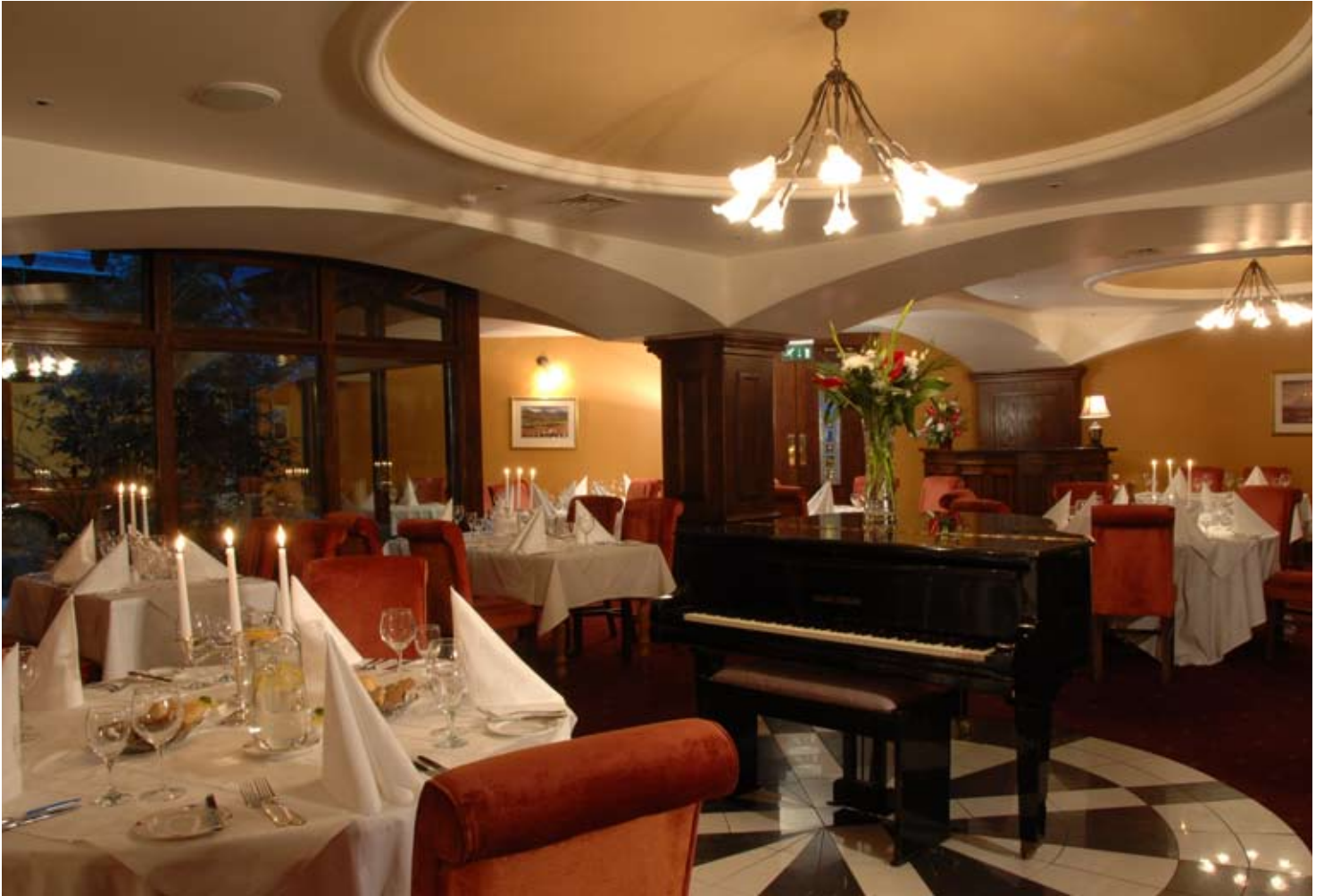
SHARE A MOMENT WITH THE ROMANCE OF OUR DINING EXPERIENCE